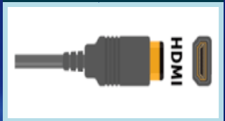
J700 HDMI output