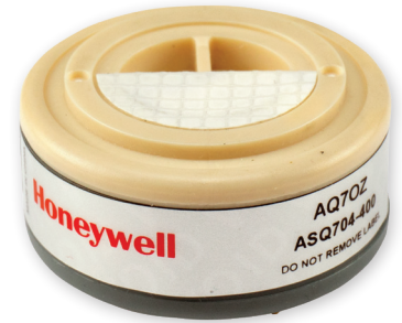
Sensor Part Number: ASQ704-400

The AQ7 Series are for environmental applications; other applications, including industrial safety, may not be suitable.