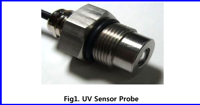
Fig1. UV Sensor Probe