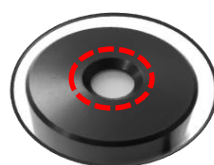
UV Detecting Sensor