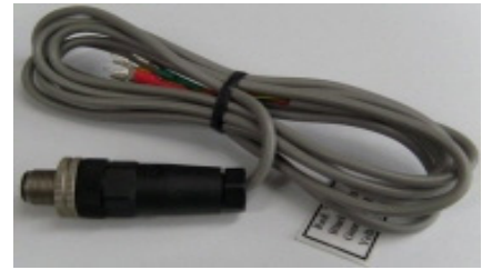
Connector (IP67, 5m)