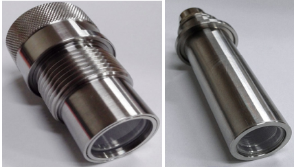
GUVC-T11GW-DVGW (left ,Measuring window tube) GUVC-T11GC-DVGW (Right , Sensor shaft)